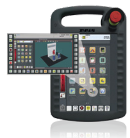
Foreign external user interfaces can be operated via reisPAD

For further information please contact us at info.industries.de@kuka.com