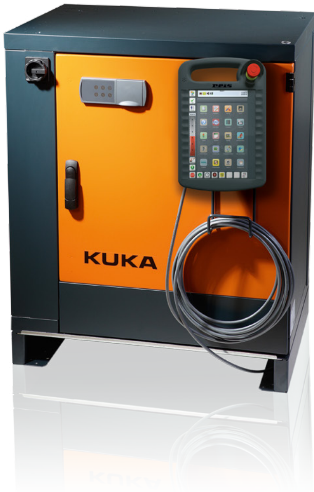
KRC ROBOTstar – State-of-the-art control technology