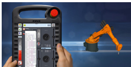
TouchMotion – move robot in intuitive and analog way