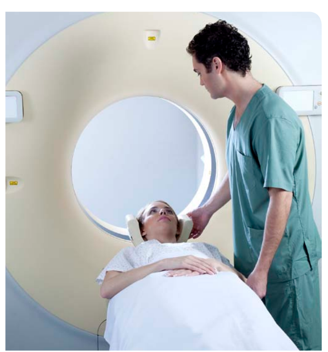
A CT or "CAT" scan is usually one of the first tests used to diagnose stroke.

Other conditions with similar symptoms to stroke and transient ischemic attack (TIA) will need to be ruled out to diagnose stroke. Some of these include seizures, fainting, migraine headaches, heart problems or other general medical conditions.