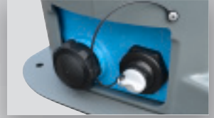
Easy access to fresh & grey water outlets.