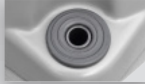
Pump-out port integrated into base saves servicing time.