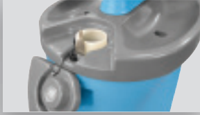
Tethered cap securely conceals and protects freshwater fill.