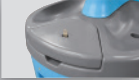
Prevent debris and vandalism with a lockable refill cap.