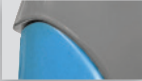
Gray plastic parts act as a bumper in case of tipping.

The new Breeze comes with features operators said they want in a handwash station. To maintain its attractiveness the blue areas have a fleck pattern to hide scuffs and scratches. It also has extended bumpers on the side and top to buffer it while traveling. There are fresh and grey water drain plugs and an additional pump out port on the base for waste water. To aid drivers, all plugs are tethered to the unit to prevent loss or damage. It has two handles for lifting and fits easily inside most portables for ease of transporting. Most of all, it has a sealed fresh water tank where chlorine can be added to kill bacteria. All in all, it is a breeze to maintain and operate.