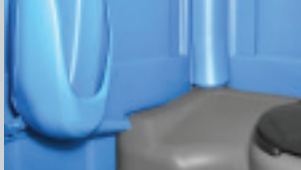
Color-matched urinal reduces visual clutter