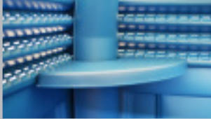
Convenient corner shelf molded around vent pipe