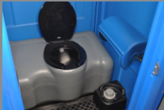
The Global is available with an economical, recirculating foot flush option.

Floor Space: 40.75" x 19.25" (1035mm x 489mm)