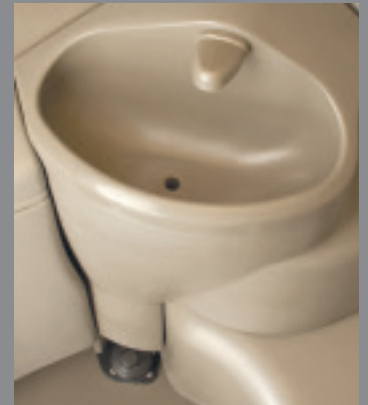
Foot-operated hand wash station keeps germs from spreading