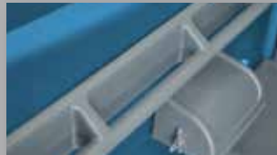
Strong handrails on two sides ensure customers remain safe and secure while in use.