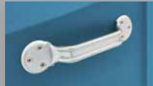
Four exterior-mounted handles make positioning hassle-free.