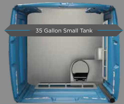
35 Gallon Small Tank