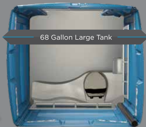
68 Gallon Large Tank