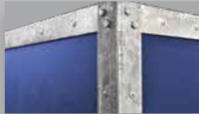
Galvanized edges and corners protect against the environment.