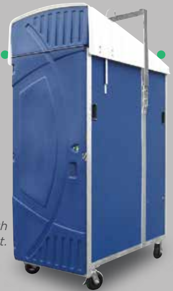
Highrise with optional lift kit.

The Highrise is sized to go where other restrooms cannot. With the optional roof it is only 33.5 inches wide and 78.2 inches high. This allows the Highrise to be moved through halls and doorways to the place where workers need it most. The casters are sealed to prevent freeze up and can be greased for continued reliability. The frame and floor are made from galvanized metal to prevent damage while lifting and handling. This uniquely designed restroom fills the need for privacy, maneuverability, and dependability.