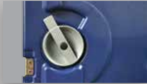
Easy-grip door handle makes it easy to lock and unlock.