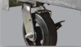
Sealed casters with greased bearings will not freeze up.