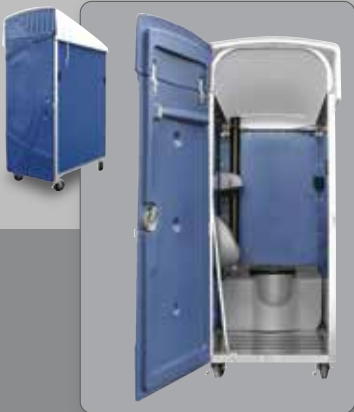
FULLY PRIVATE (optional)

Fold-down roof and door reduce overall height to fit through standard door openings.