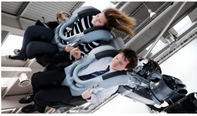
Full centrifugal force ahead. The KUKA Coaster features the full range of motions for modern action entertainment, from a child-friendly rotation about the axis to a turbulent inverted twist. It's good to know that the KUKA Coaster conforms to EN 13814 for amusement rides and amusement parks.