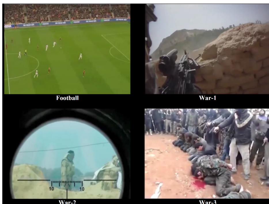
Figure 1. Sample screenshots of the presented videos

The paradigm lasted 11:55 minutes. It comprised 6 rest conditions (24s each), 3 football conditions (30s each), 3 videos of war-1 condition (30-50s each), 2 videos of war-2 condition (30s each), and 5 videos of war-3 condition (34-60s each). The conditions were initially randomly distributed; then, the same paradigm was presented to all study participants. The videos and their sounds were presented to the research participants during the MRI scan using a goggle (800×600-pixel resolution in a 0.25 square area and refresh rate of up to 85 Hz) and an earphone (30 dB noise-attenuating headset with 40Hz to 40 kHz frequency response), i.e. appropriate to up to 4.7T magnetic fields (VisuaStim, The Pennsylvania State University, USA).