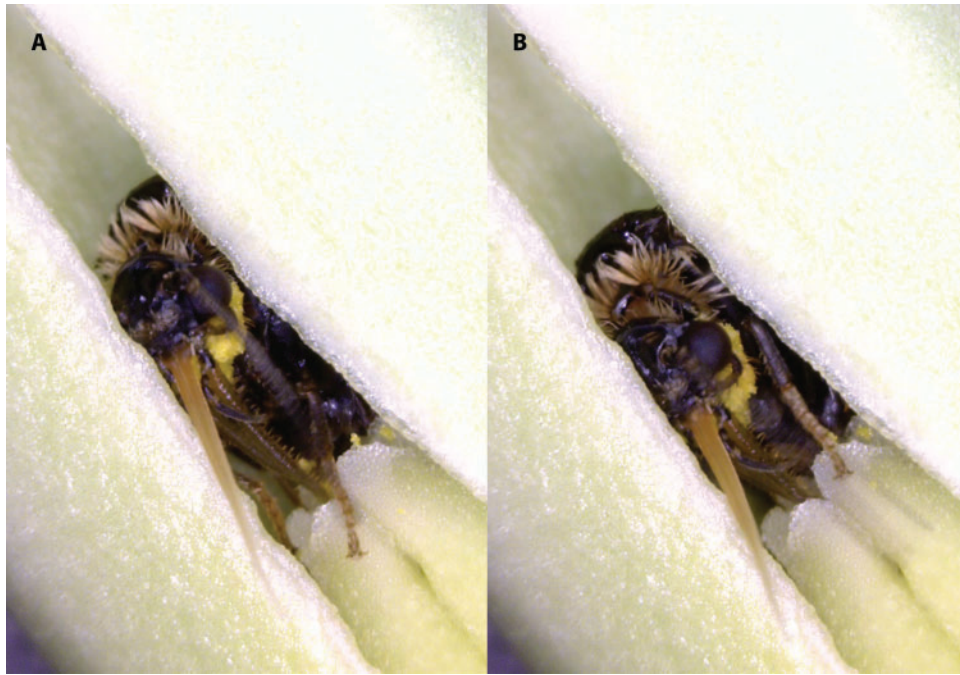
Fig. 3. A female yucca moth ( T. antithetica ) pollinating a Joshua tree ( Y. jaegeriana ). Four petals have been removed from the flower to allow a view into the corolla tube. (A) The moth extends her tentacles with some pollen near the ends toward and into the stigma, with proboscis extended. (B) The moth quickly lowers her head, pushing her tentacles into the stigma, and then raises it again. The moth's forelegs rub against the tentacles throughout the process.

since the previous pollination event (linear regression, df = 1 and 7 , R^2 = 0.3802 , F = 591 , P = 0.0454 ). That is, longer pollination events were associated with longer periods of time between pollinations.